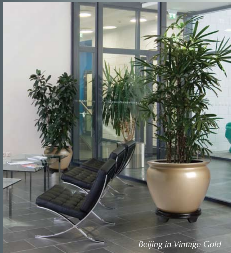
Beijing in Vintage Gold

The next fifteen pages showcase the most beautiful indoor pots in the industry. If you see something you like, call us for a price quote. Our courteous sales professionals are always eager to help answer your questions.