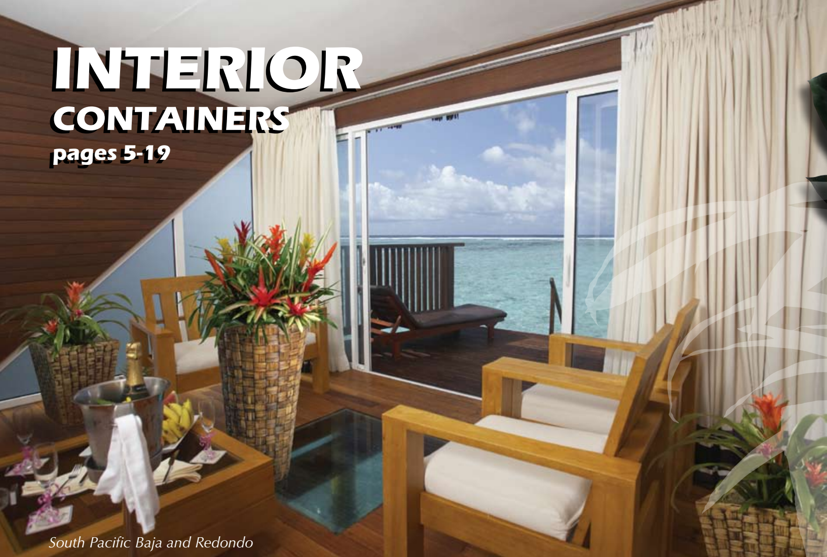
South Pacific Baja and Redondo

Whether your needs call for fiberglass, plastic or metal, Primescape meets your interior needs with a large selection of quality containers.